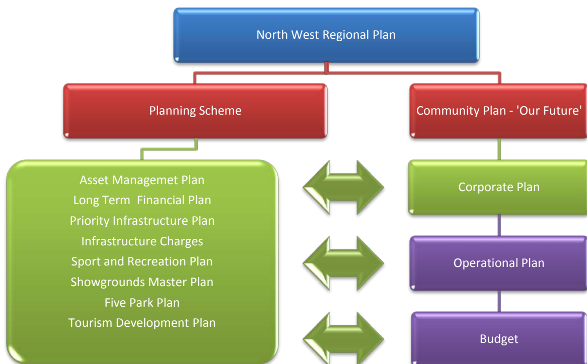
Planning Model Diagram

The Flinders Shire Community Plan – ‘Our Future’ identifies and correlates with many other planning documents in the region and within the shire as outlined in the planning model diagram. Thus setting the foundations for strategic and integrated planning process guiding council in the goals of the community whilst allowing Council to make informed decisions to achieve these goals within their available resources.